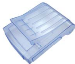
Spill proof cover